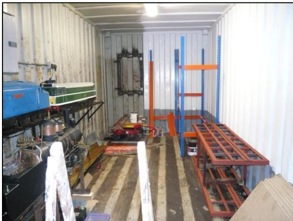
Picture taken on 12 th Dec inside Container 7 of the new 5" and 3 1/2" loco storage facility showing progress.

In addition to this work many other tasks are being progressed by many smaller groups, some as small as one, covering many aspects of the site from roofing, fencing, leaf clearance, RTR fishplate greasing and track alignment, also storage facilities for the future.