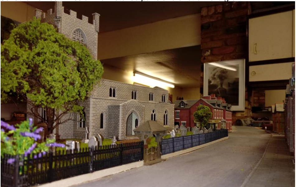
The church yard has been populated with numerous graves - I wonder if any one famous is buried here