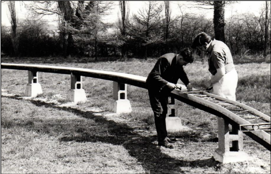
White trousers on a working day! Can you identify these two? Answer is on page 22

become a little more informal! If you can add any details to the pictures below your editor would be pleased to hear from you.