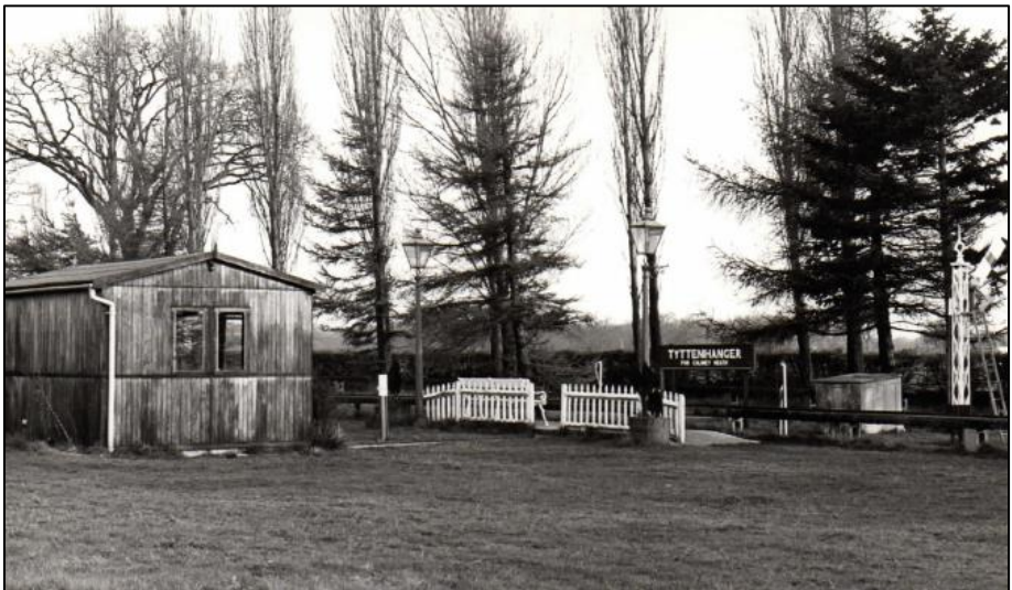
Taken in 1970 the shed has certainly lasted well.